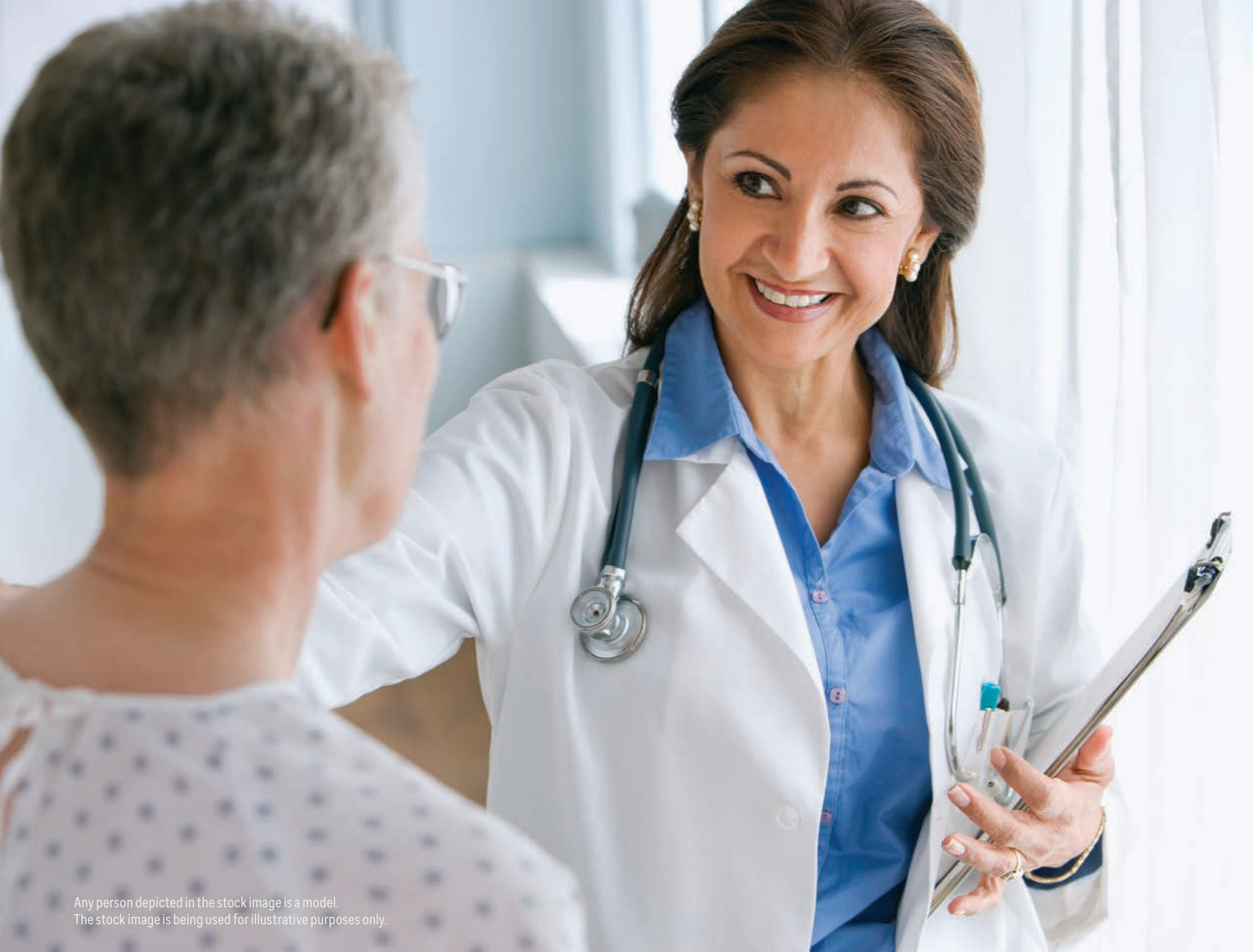
Any person depicted in the stock image is a model. The stock image is being used for illustrative purposes only.